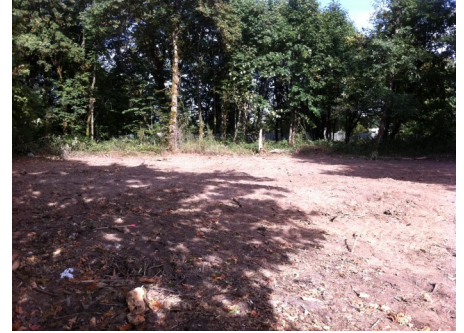
Chinook Park site cleared of underbrush, debris, and unhealthy trees.

As of this printing, all major development for the Chinook Neighborhood Park has been put on hold pending the Board of County Commissioners' work session on capital issues which will take place Tuesday, November 8th in the sixth floor training room of the Public Service Center, 1300 Franklin Street at 1:30 pm. The NSCNA continues to raise funds to support the completion of this park. We have been waiting a long time for a park to call our own, so please continue to support its development!