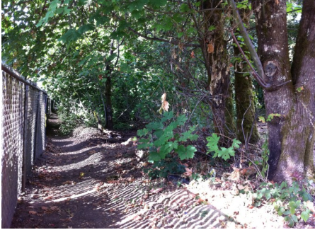
Chinook Park site before any major clearing.

As of this printing, all major development for the Chinook Neighborhood Park has been put on hold pending the Board of County Commissioners' work session on capital issues which will take place Tuesday, November 8th in the sixth floor training room of the Public Service Center, 1300 Franklin Street at 1:30 pm. The NSCNA continues to raise funds to support the completion of this park. We have been waiting a long time for a park to call our own, so please continue to support its development!